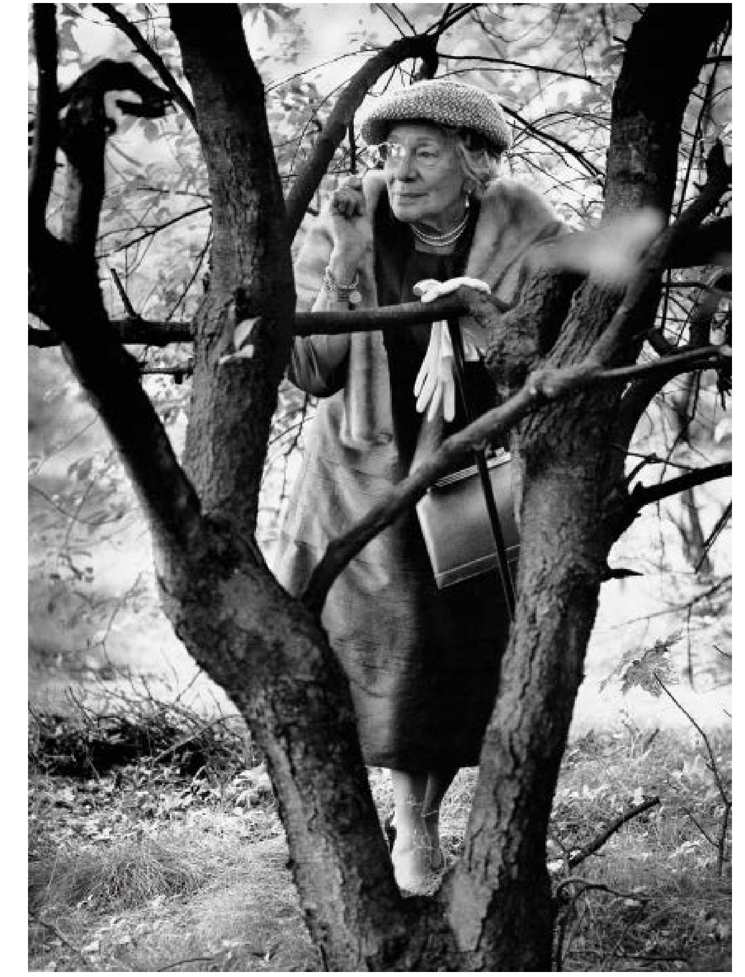
Tilla Durieux, 1963.