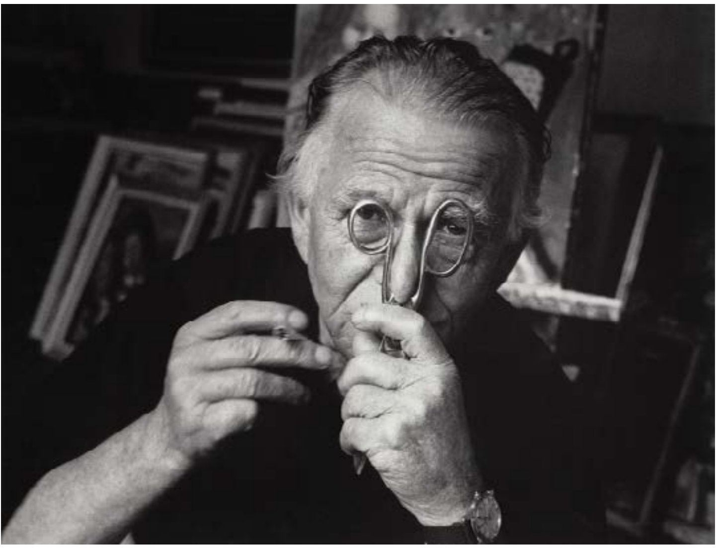
Otto Dix, 1964.

√ Today Moses still lives in Schwabing, in an apartment given to him by the city of Munich, in gratitude for a lifetime of representing the nation. He reflects, 'Such were my years –